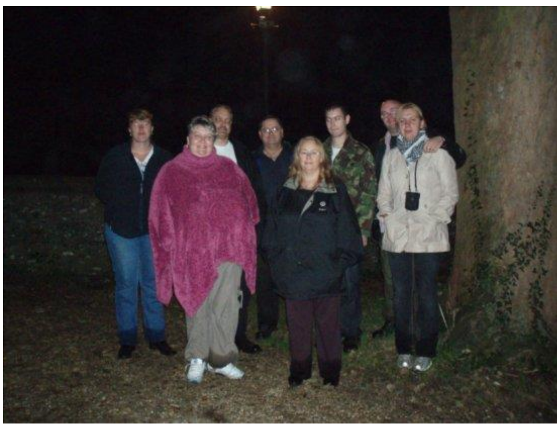
Some of the Investigation Team